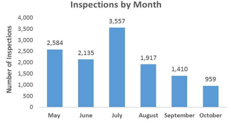
Figure 1. Total number of inspections per month in 2016.